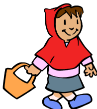
red riding hood